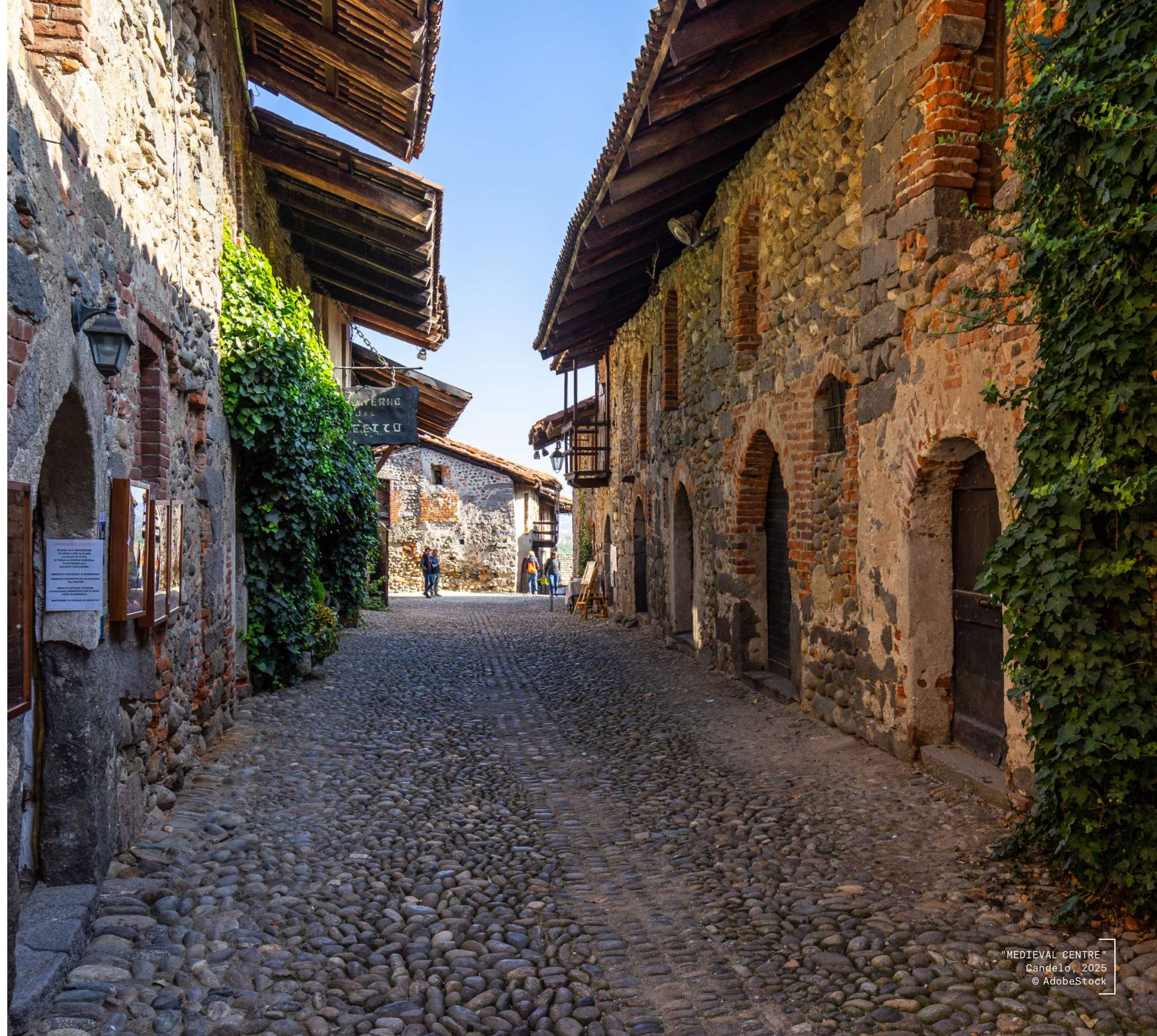
"MEDIEVAL CENTRE" Candelo, 2025

Here, everyday life revolves around schools, sports facilities, and small squares which, despite their potential, often remain underutilised or disconnected from the more vibrant parts of the urban fabric.