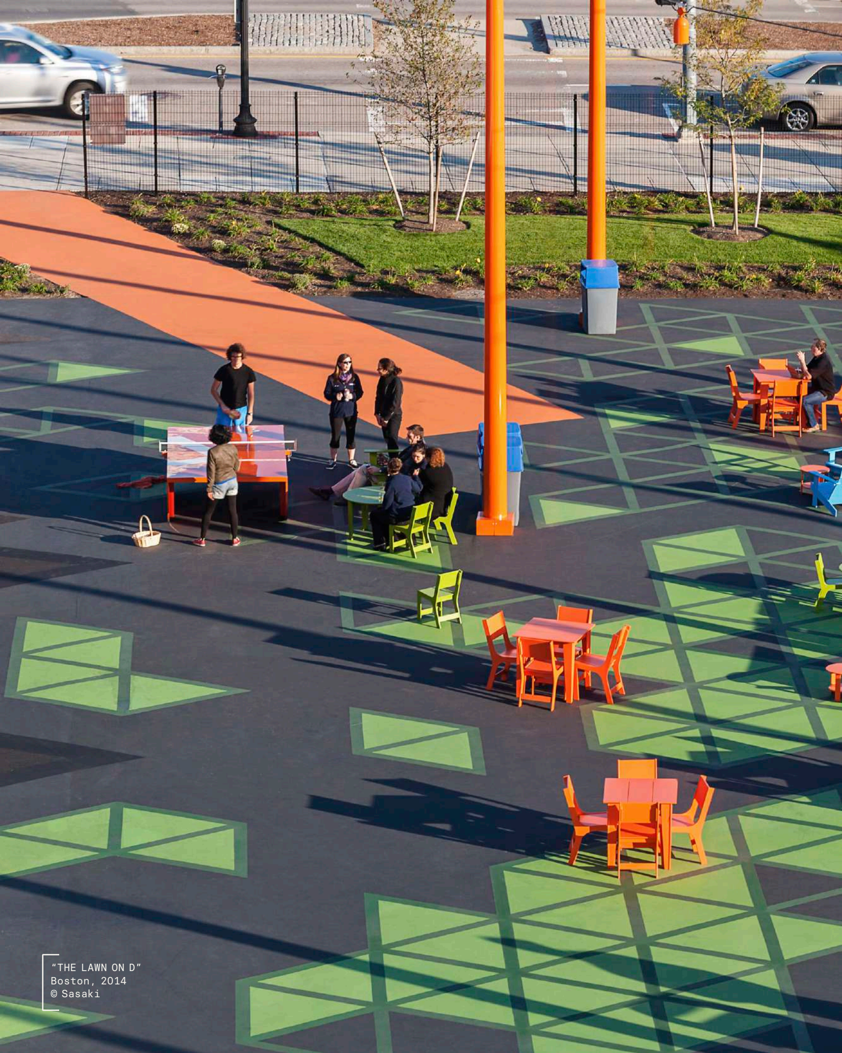
"THE LAWN ON D" Boston, 2014 © Sasaki