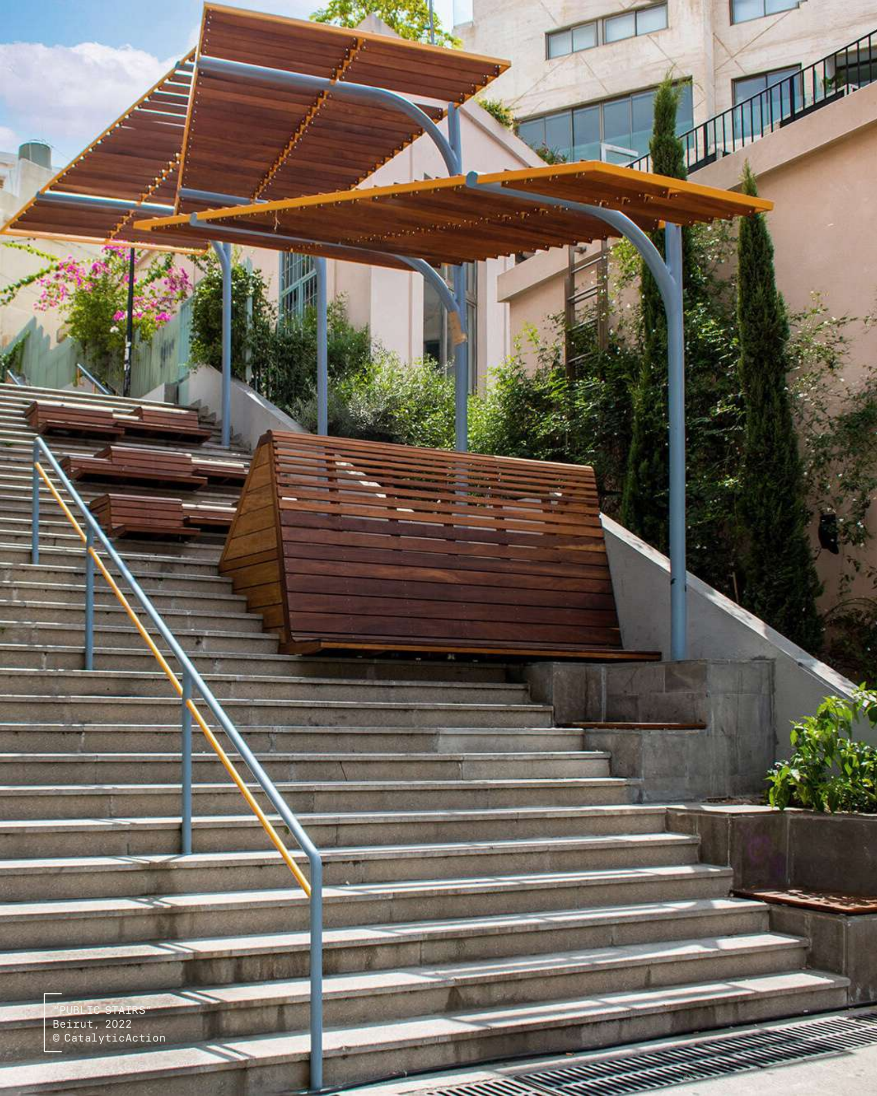
"PUBLIC STAIRS" Beirut, 2022